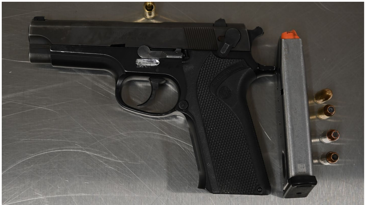
Additional handgun located during search warrant.