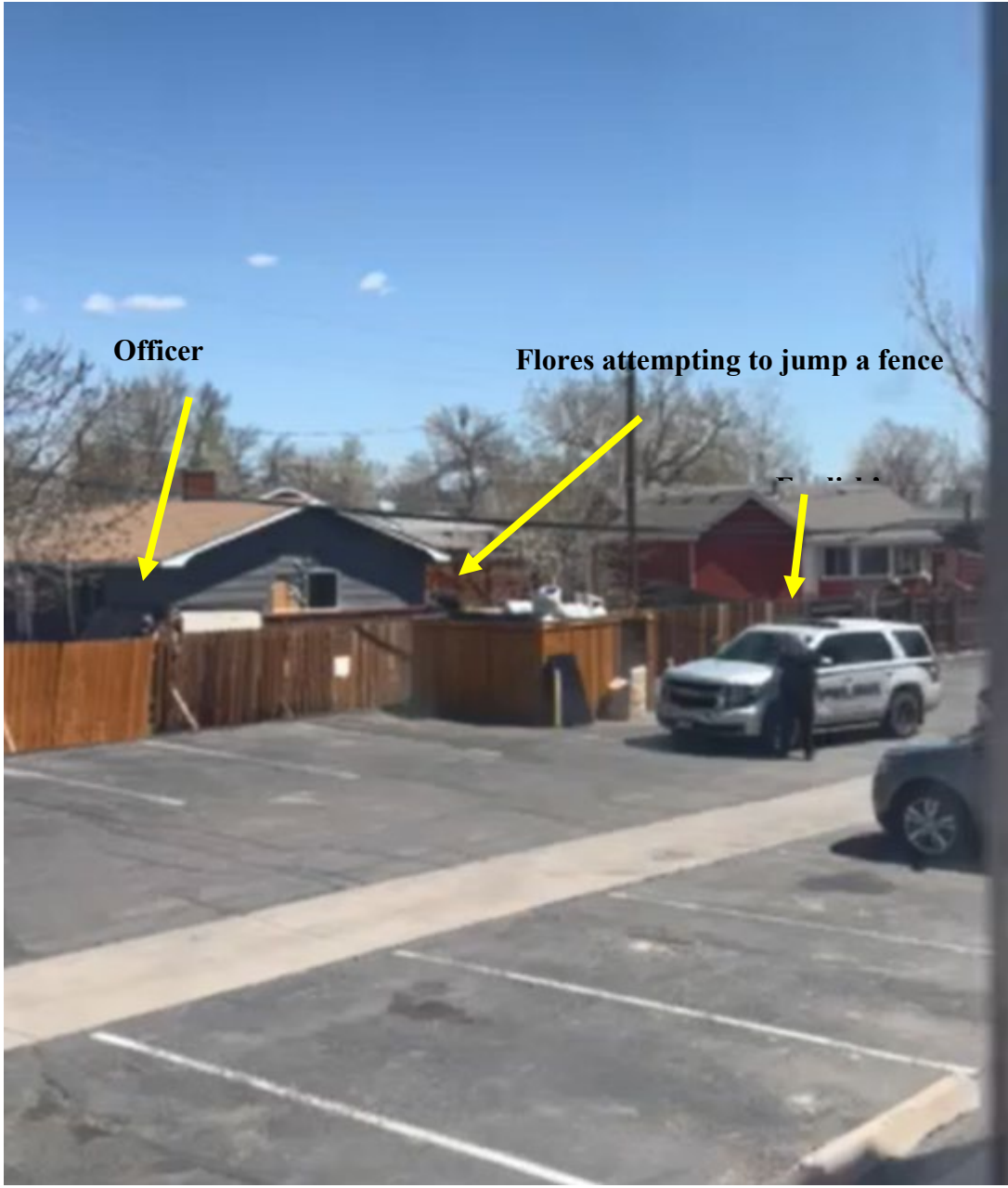
View looking northeast towards the garage from a neighbor.