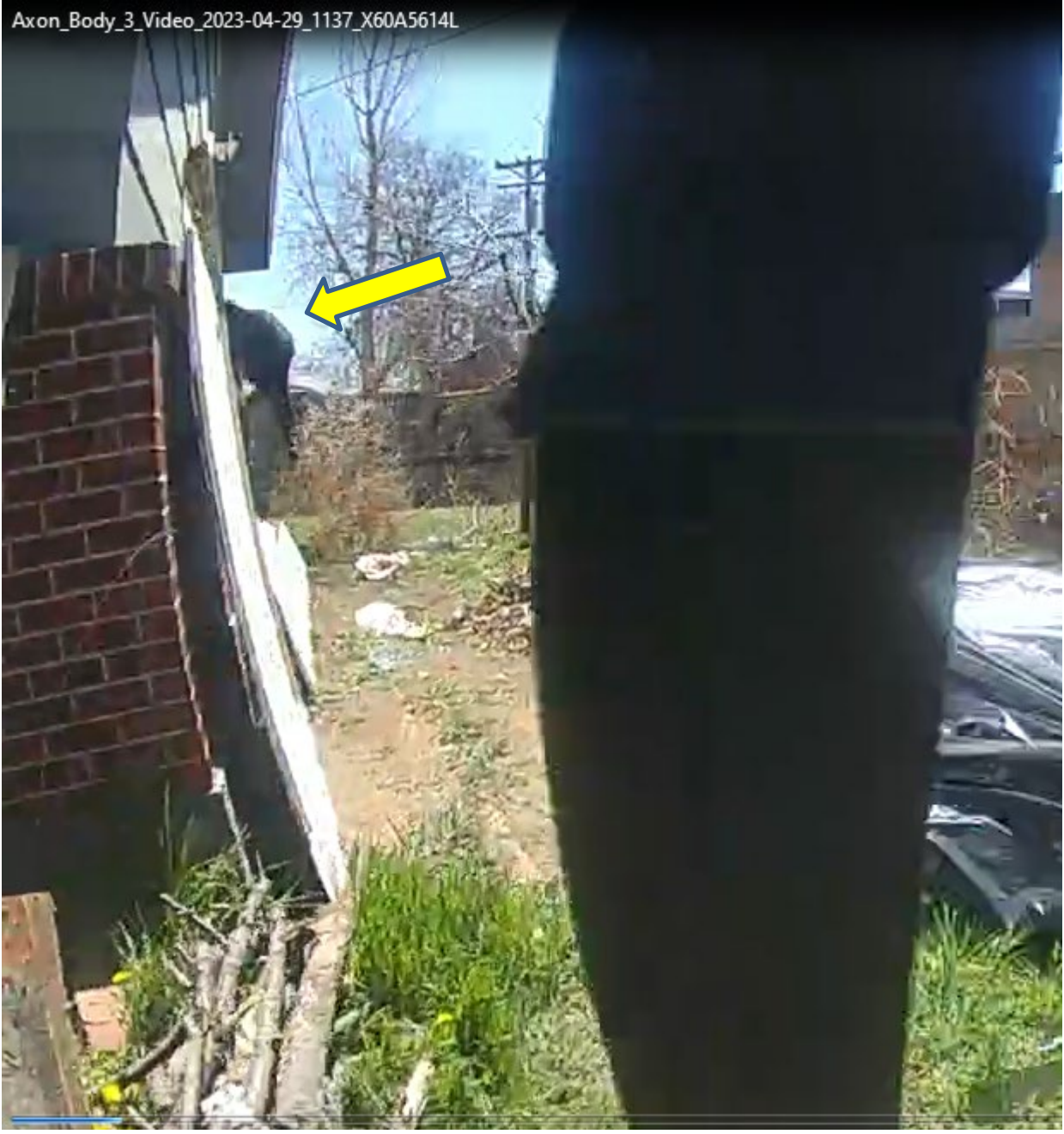
Kantor's body cam view as Flores is attempting to jump the fence before being shot.

Axon Body 3 Video 2023-04-29_1137_X60A5614L