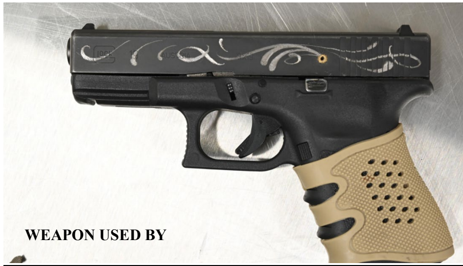
WEAPON USED BY