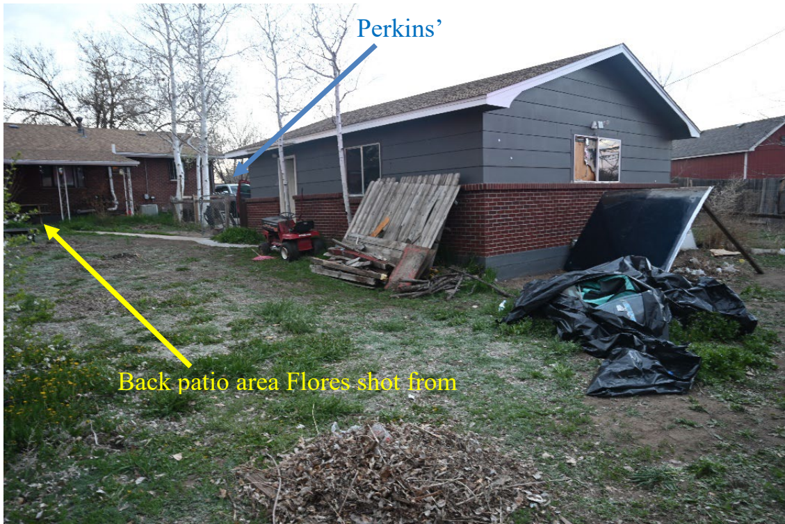
Backyard view of 1802 7 th Street