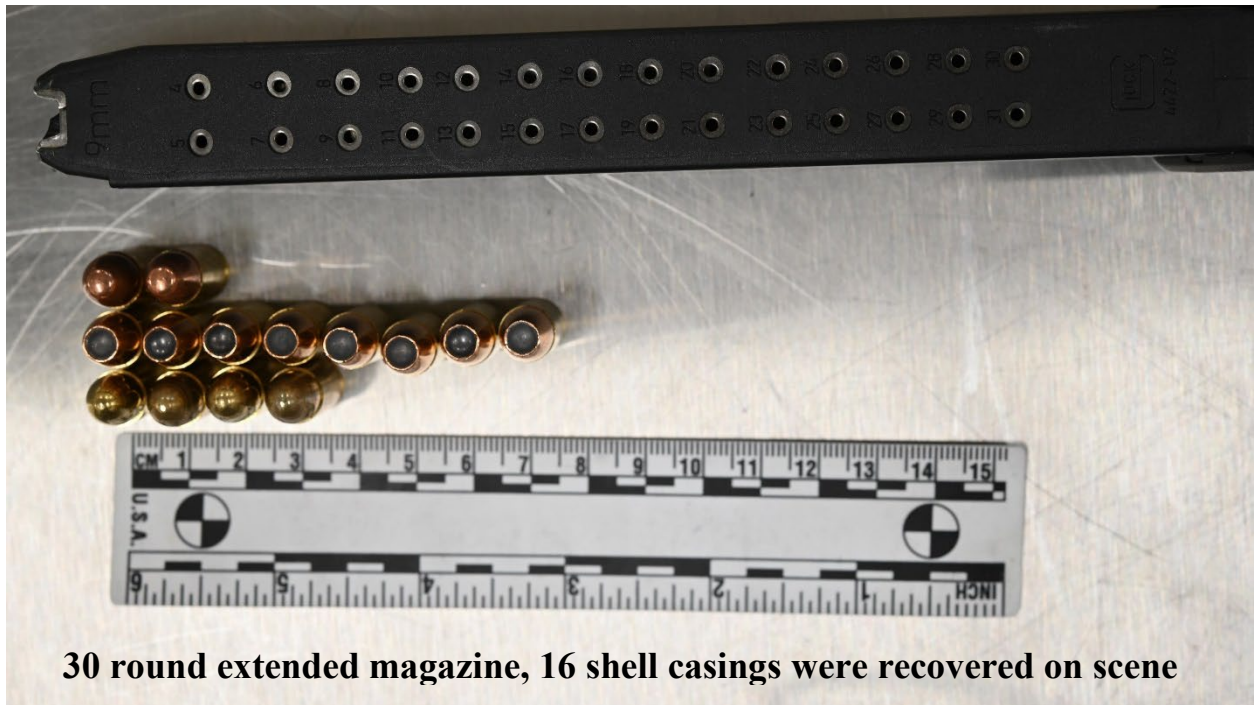
30 round extended magazine, 16 shell casings were recovered on scene